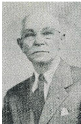
Answers on page 5